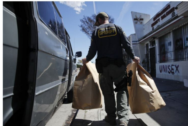
A Los Angeles County sheriff's deputy loads evidence bags into a van after raiding an illegal cannabis dispensary in Compton in 2018. State lawmakers are considering new fines for landlords and advertisers that aid illegal pot shops.

By PATRICK MCGREEVY | STAFF WRITER JULY 20, 2020 | 5 AM